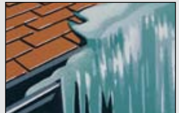
Backed up at the eaves by ice dams, melting snow finds access the same way.