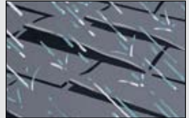
Wind-blown rain trapped under your roof's top layer seeks out those channels.