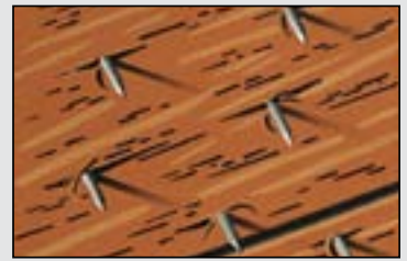
Nail holes and joints in your roof deck provide the channels for water to seep through.