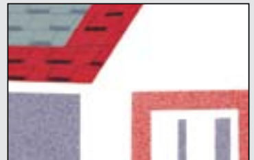
Applying a layer of Moisture Guard Plus to the deck at all rake and eave edges a minimum of 24" beyond the interior wall line will provide a last line of defense against leaks, to help prevent backed-up water from getting into the home.