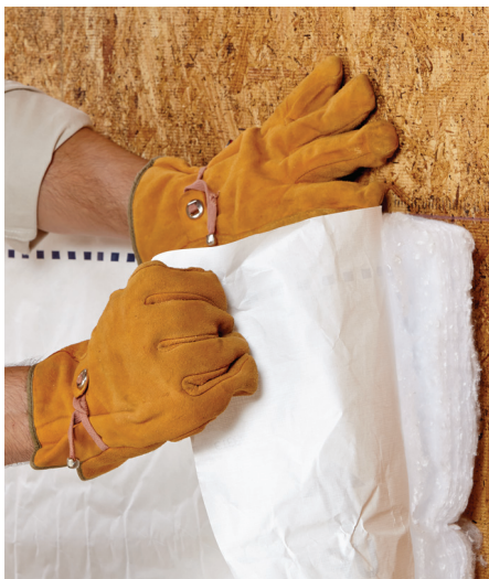
DuPont™ Tyvek® ThermaWrap™ 5.0 provides breathable air, water and thermal protection in one roll.

DuPont™ Tyvek® is a nonwoven, nonperforated sheet of spunbonded high-density polyethylene (HDPE) with microscopic pores large enough for moisture vapor to pass through, but small enough to resist air infiltration and water intrusion. The unique combination of properties – air infiltration resistance, bulk water resistance and vapor permeability help protect a home from the elements, improve energy efficiency and prevent moisture from accumulating in walls.