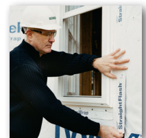
All Dupont™ Flashing Systems products are designed to be compatible with DuPont™ Tyvek® weather barriers.